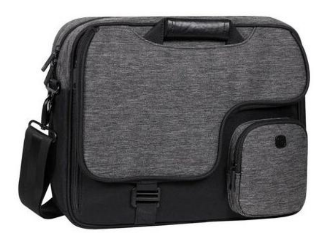
Minimum Qty: 24