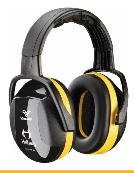
Secure™ Passive Hearing Pro Headband 26dB